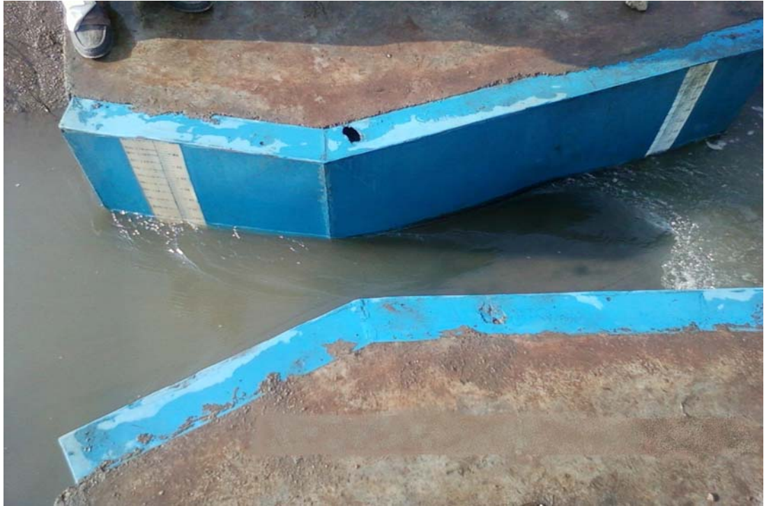
Cut throat flume arrangement for Telhara Minor Irrigation Tank, Taluka Chikhali, District Buldhana.