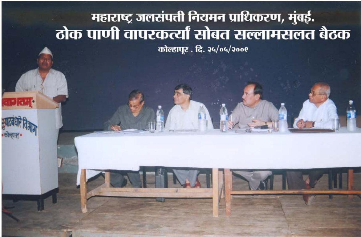
Stake Holder Consultation meeting to discuss Approach Paper on Developing Regulation for Bulk Water Pricing at Kolhapur on 25/05/2009