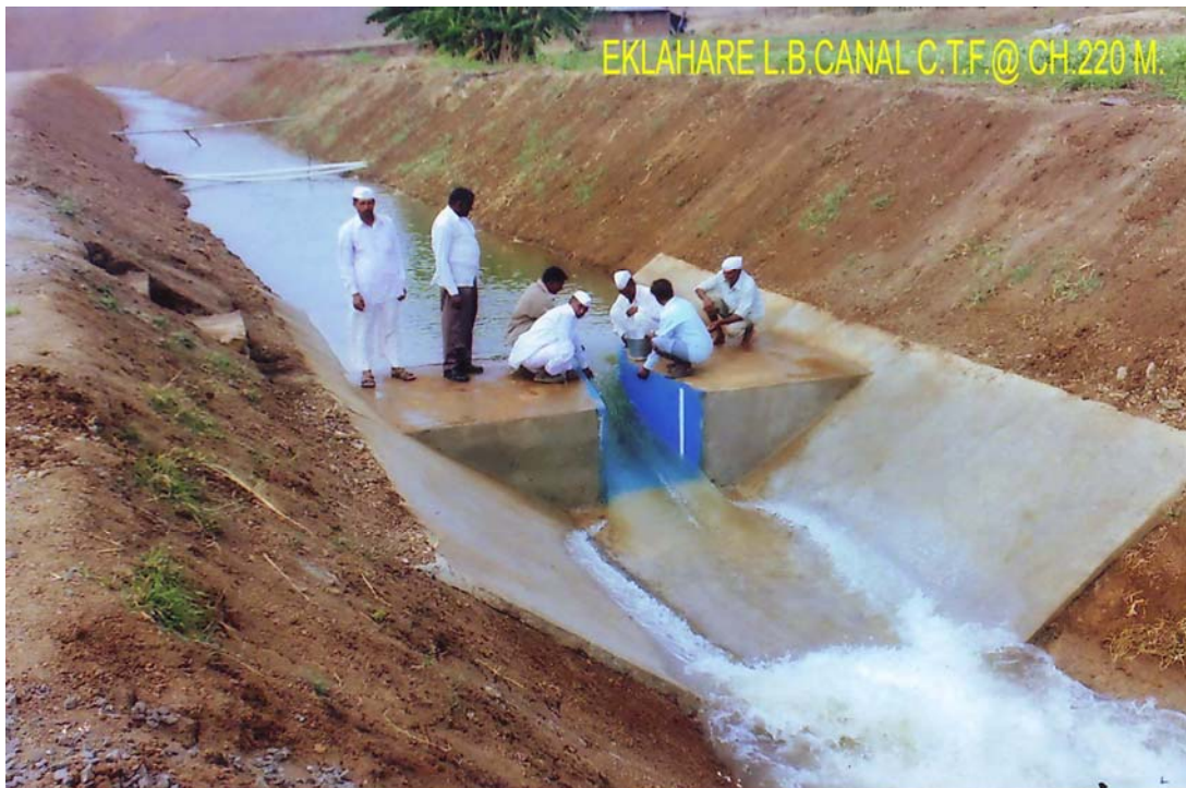
Cut throat flume arrangement for Eklahare Minor Irrigation Tank, Taluka Dindori, District Nashik.