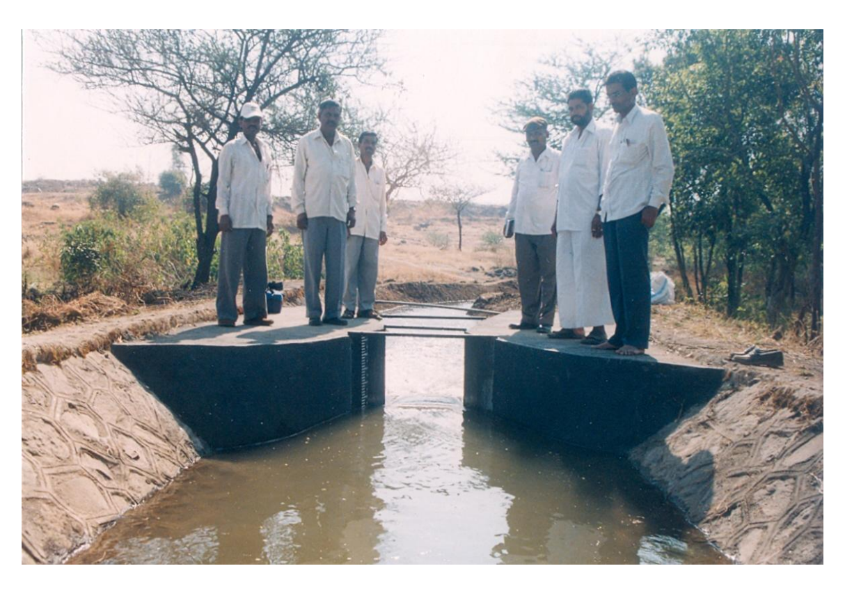
Cut Throat Flume of Left Bank Canal of Diwale MI Project Taluka Bhor, District Pune