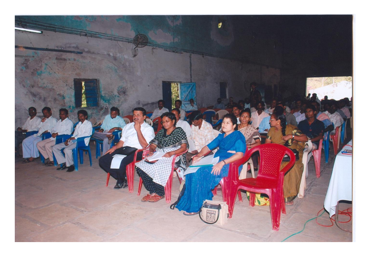
Preparing Criteria for Bulk Water Tariff – Stake holder consultation meeting convened by MWRRA at Pen, District Raigad on 17/02/2009