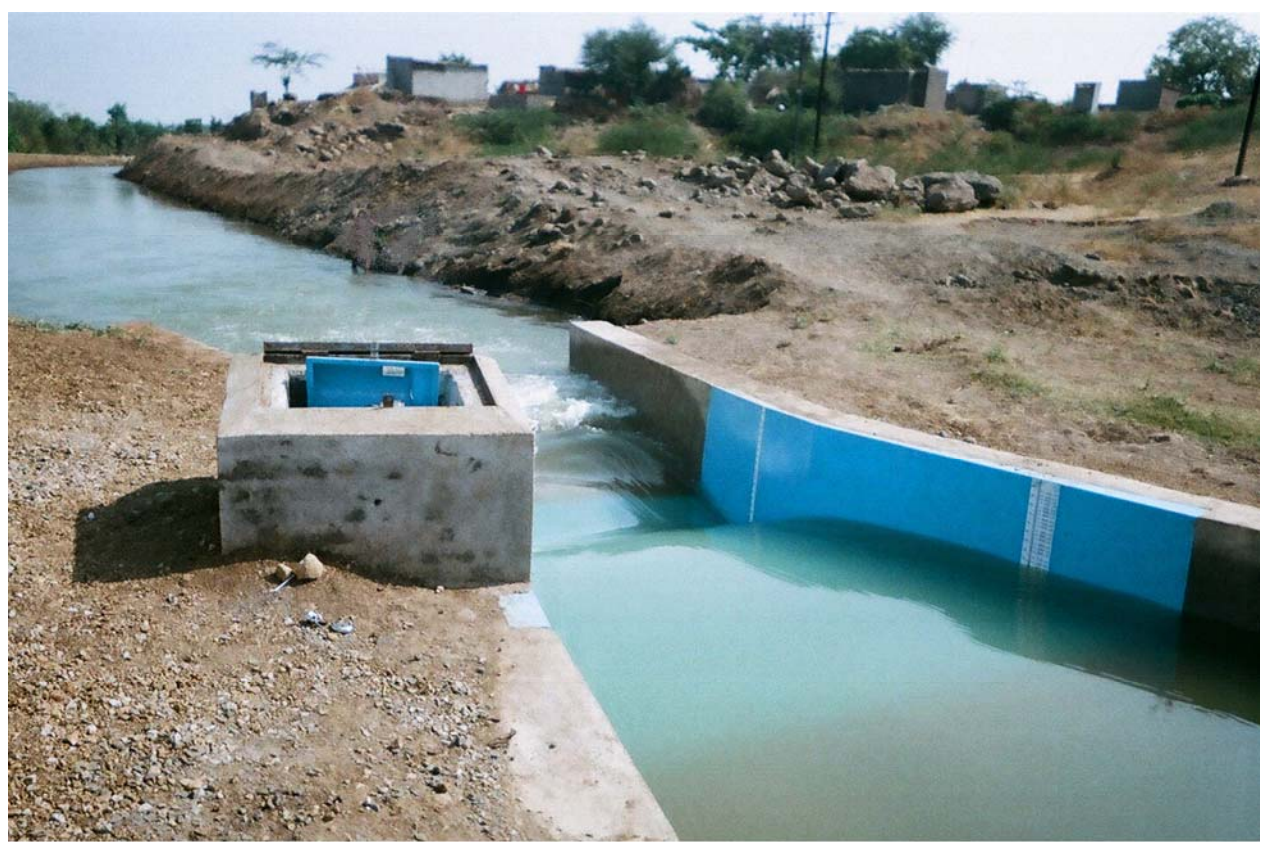
Parshall Flume Of 150 Cusecs Capacity With Digital Water Stage Recorder @ ch 0/400 of Mangi Right Bank Canal Of Mangi Medium Project Tal.Karmala Dist.Solapur.