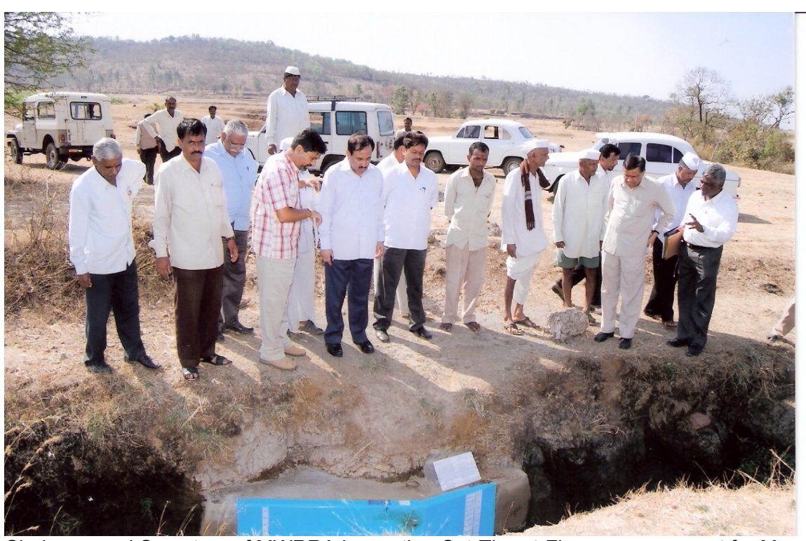
Chairman and Secretary of MWRRA inspecting Cut-Throat-Flume arrangement for M. I. Tank at Benikre, Taluka Kagal, District Kolhapur (One of the Six Pilot Project) along with Beneficiaries