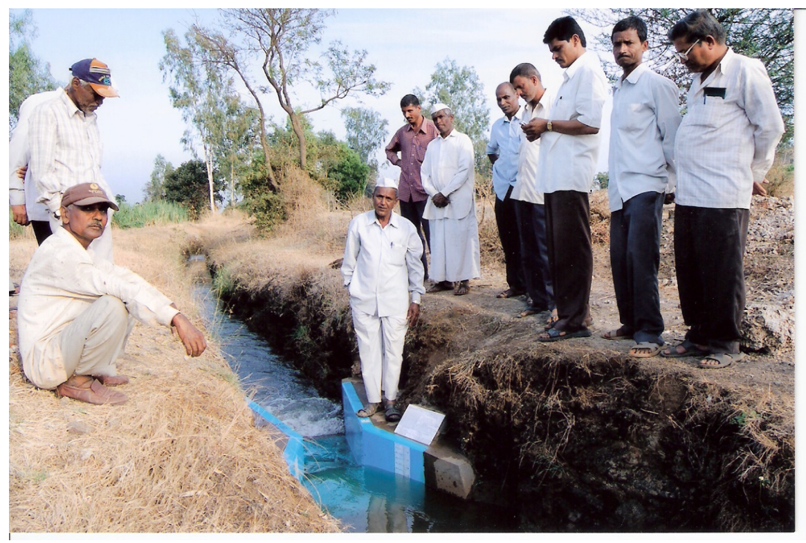
Beneficiaries of M. I. Tank at Benikre, Taluka Kagal, District Kolhapur (One of the Six Pilot Projects)